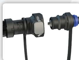
Coupler connection with water flow indicator