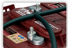
Clampless tubing (available for customizable configurations)

TROJAN BATTERY COMPANY WITH QUALITY SYSTEM CERTIFIED BY DNV = ISO 9001:2015 =